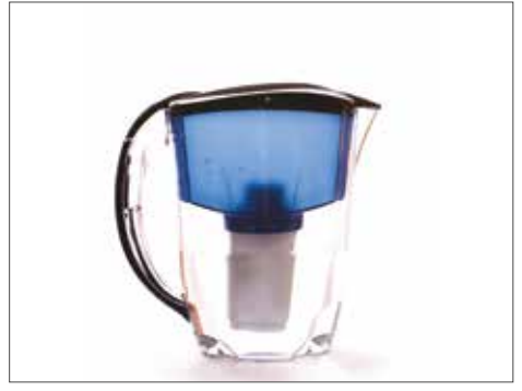
No more waiting around for the filter jug to be full again.