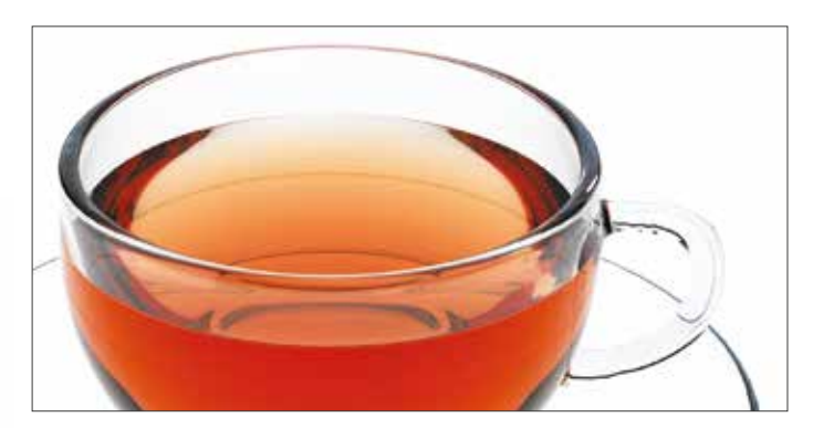
Enjoy the perfect cuppa without the layer of film on the top.