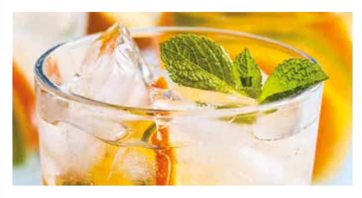
Great tasting drinks with all the flavour.