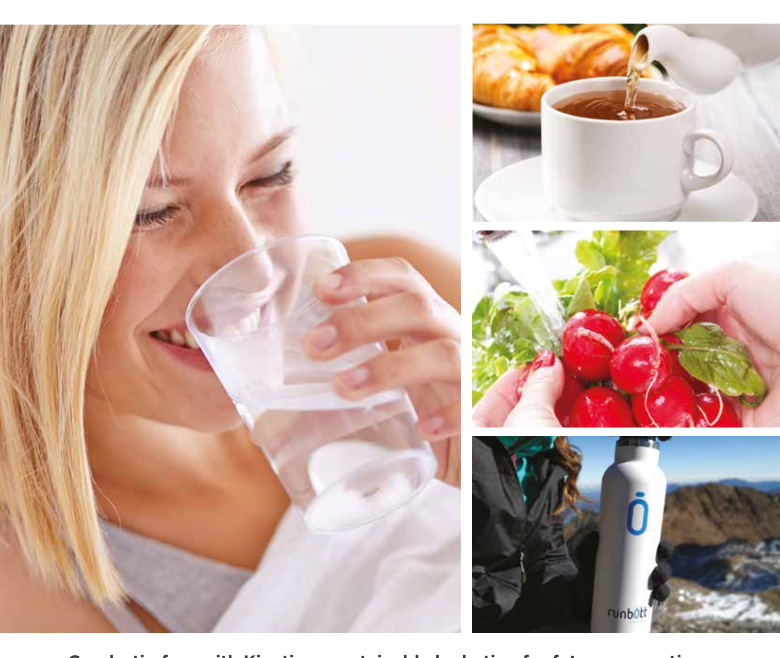
Go plastic-free with Kinetico - sustainable hydration for future generations