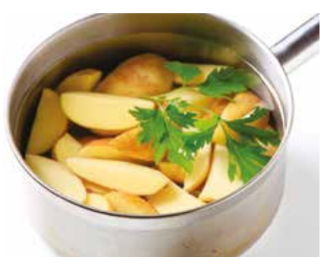
Why would you cook with impurities in your water?